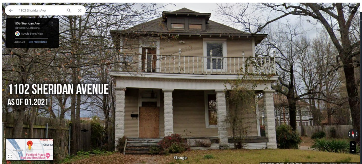
Exhibit A. - Building Façade