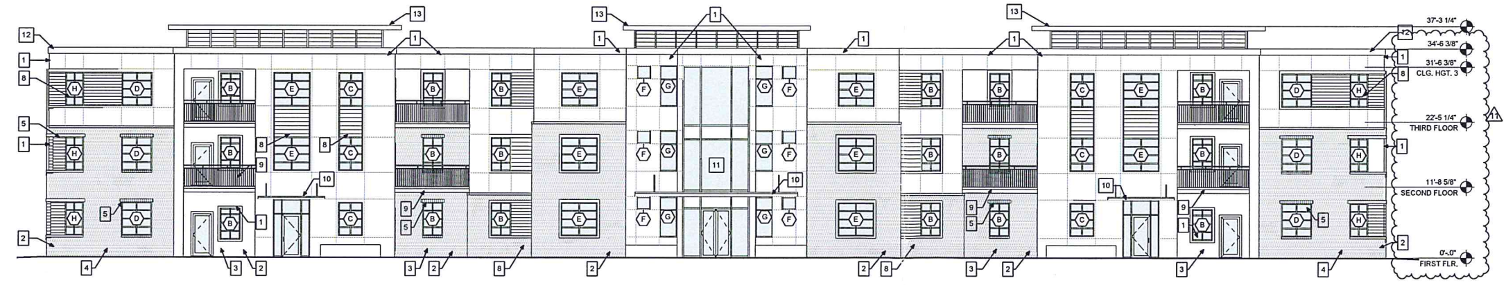
4 SOUTH ELEVATION 3/32" = 1'-0"