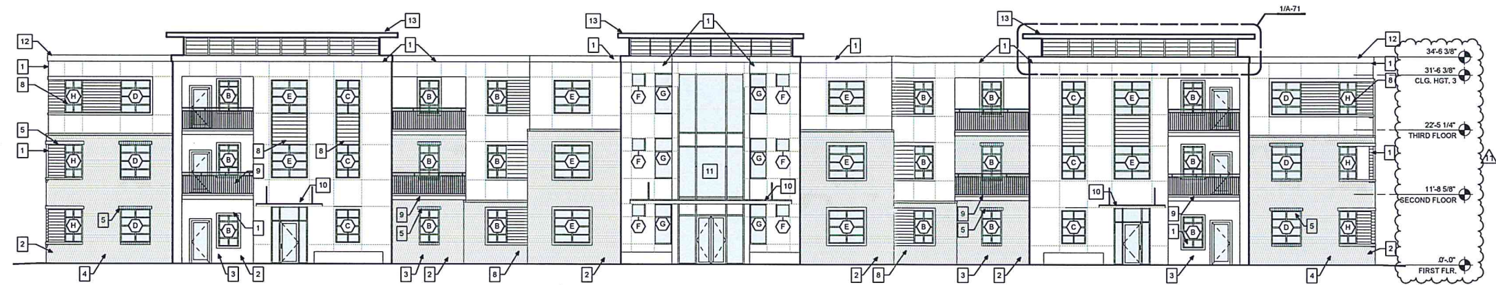
1 NORTH ELEVATION 3/32" = 1'-0"